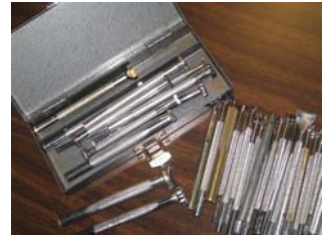
The decorative end of the metal tool is pounded with a mallet into leather.

The craft of hand leather tooling dates back to 1300 BC in Egypt. In America, the craft became popular in the 1800s to early 1900s when cowboys and ranchers embraced the "Wild West" theme.